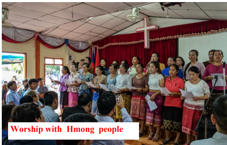
Worship with Hmong people