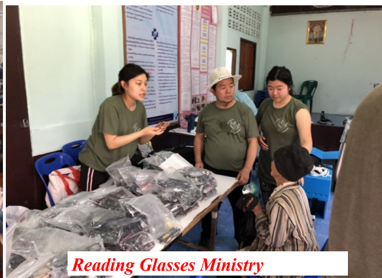
Reading Glasses Ministry