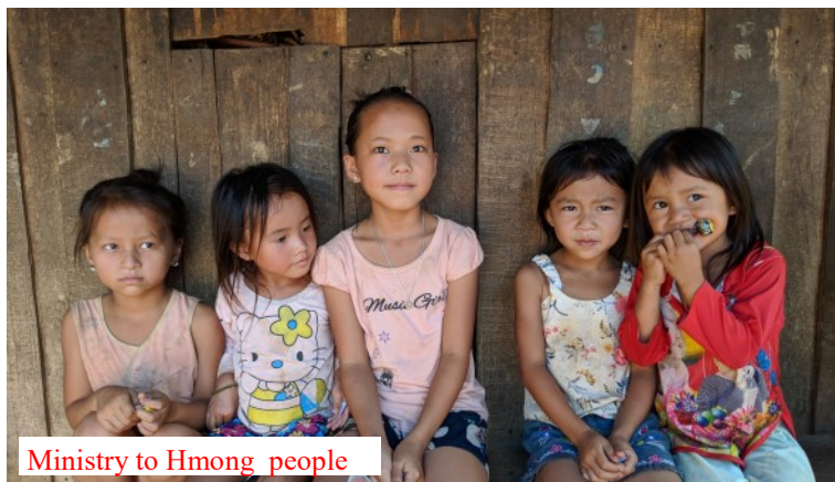
Ministry to Hmong people