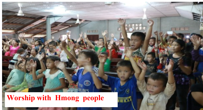
Worship with Hmong people