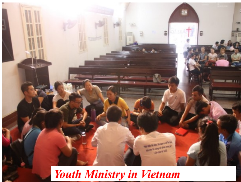
Youth Ministry in Vietnam